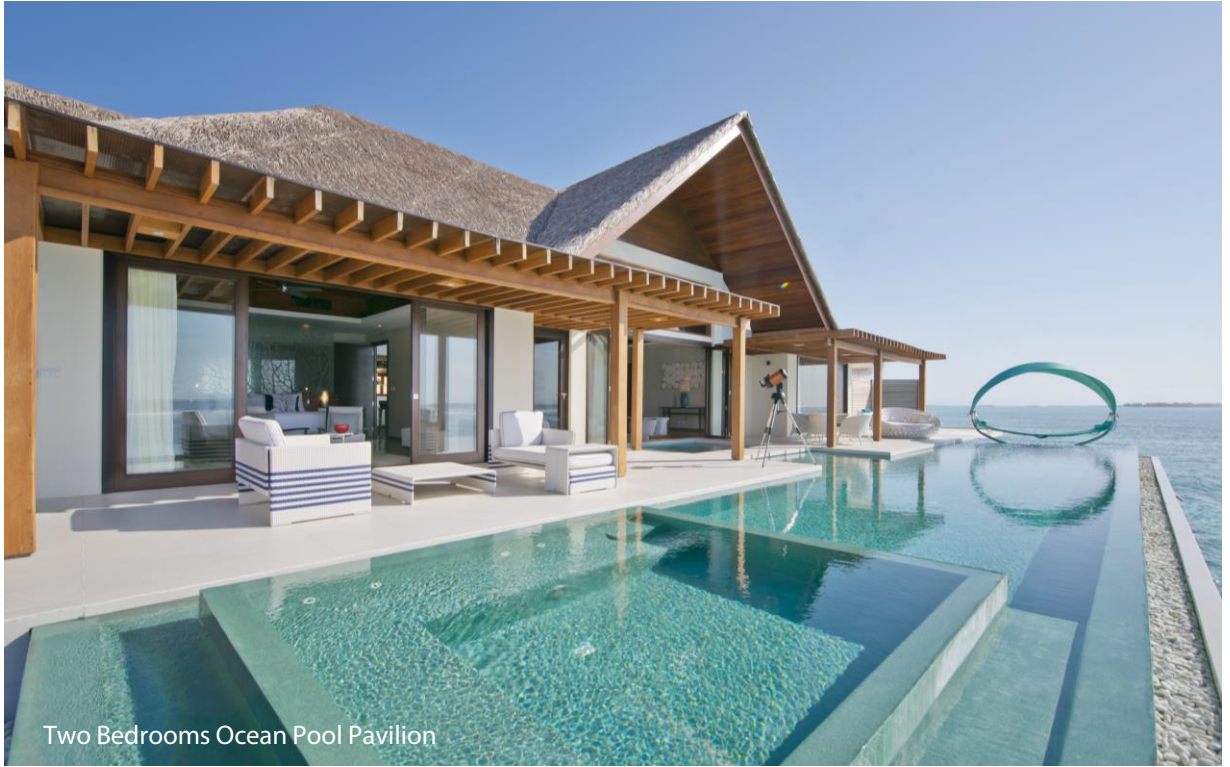
Two Bedrooms Ocean Pool Pavilion