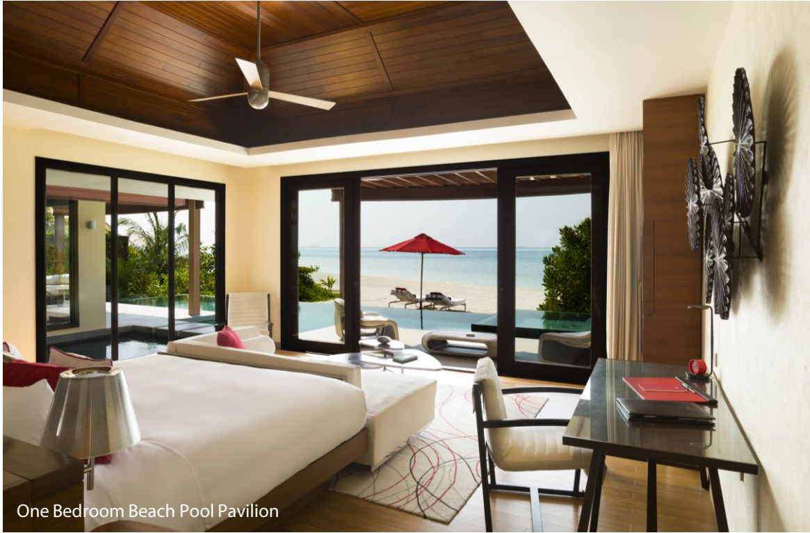
One Bedroom Beach Pool Pavilion